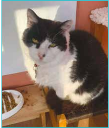
Jenny now, a perfect weight and a happy cat.

Jenny recovered well from her first operation and after just a month her weight was 3kg-she had gained 25% of her initial bodyweight! Six weeks after her second operation she had increased to 3.4kg. We were pleased that she then steadily improved, and now weighs in at a healthy 3.9kg.